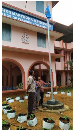
Flag hoisting ceremony