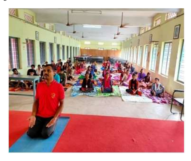
International Yoga Day Celebration

The N.C.C Unit of our college celebrated the yoga day on 21st June by arranging a special Yoga training in the college seminar hall.